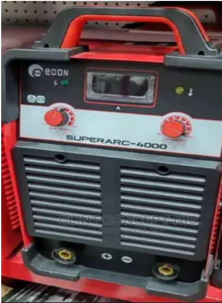
Dual Welding Machines